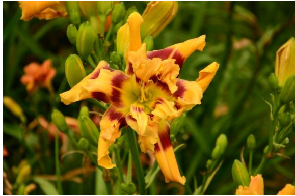
Bourbon And A Fine Cigar