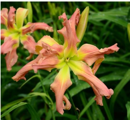
Tickle The Octopus