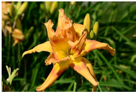
Bourbon In The Bluegrass