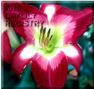
Aaron Brown (Herr-D., 2006)

height 42 in., bloom 7.25 in., season EM, Rebloom, Semi-Evergreen, Tetraploid, 17 buds, 4 branches, Burgundy red with pink watermark above yellow to green throat. (Swallow Tail Kite × Wispy Rays) Awards: AM 2016, HM 2011