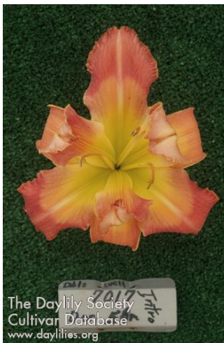
Topguns Sharon Scott (Scott-B., 2011)

height 42 in., bloom 7.25 in., season EM, Rebloom, Semi-Evergreen, Tetraploid, 17 buds, 4 branches, Burgundy red with pink watermark above yellow to green throat. (Swallow Tail Kite × Wispy Rays) Awards: AM 2016, HM 2011