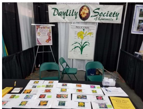
Our DSL booth at the Home, Garden and Remodeling show.